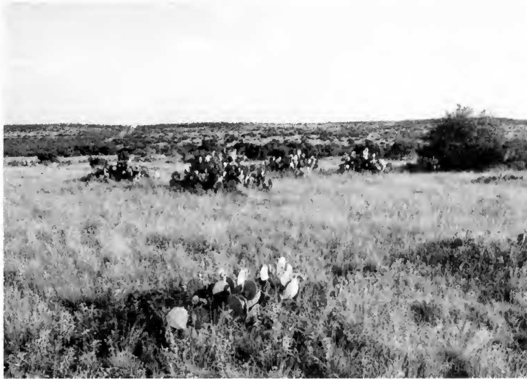
Fig. 5. Juniper-mesquite savannah near the panhandle in the northwestern quadrant of the county.